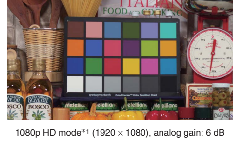
*1 Acquired with center cropping: the optical center is the same as in all-pixel scan mode.

Photograph 2 Sample Images (10 lx, 60 frame/s)