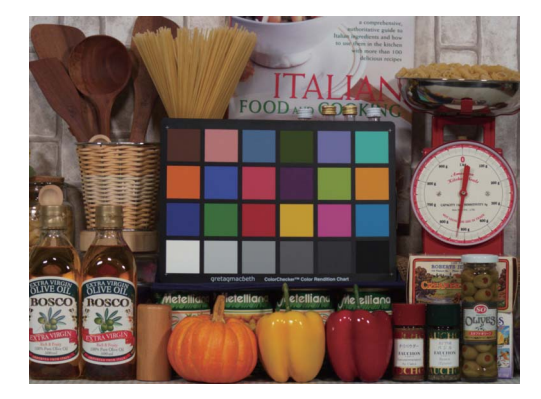
3.2M-pixel all-pixel scan mode (2048 \times 1536), analog gain: 6 dB

Photograph 1 Sample Images (2200 lx, 60 frame/s)