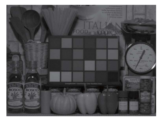
IMX036LLR analog gain: 24 dB