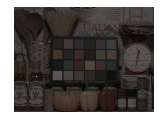
IMX036LQR analog gain: 24 dB